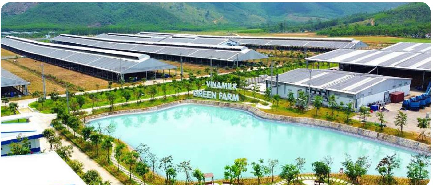
Rooftop Solar Power System at Vinamilk Green Farm in Quang Ngai Province

With these results, by the end of Q3/2024, BCG Energy had achieved 67.7% of its revenue target and 98.2% of its after-tax profit target as presented at the Annual General Meeting of Shareholders. Projections for 2024 suggest that BCG Energy's business results will continue to grow positively, supported by the completion of commercial operation procedures for an additional 21 MW from the Krong Pa 2 solar power plant (Phase 1). Additionally, the operating rooftop solar projects will benefit from the 4.8% rise in electricity prices effective October 2024. With a current operational rooftop capacity of 75 MW, BCG Energy plans to complete a minimum of 15 MW in 2024 and 150 MW in subsequent years. With favorable macroeconomic factors and positive recovery signals, the Company has been actively accelerating the implementation of its business plans to achieve its targets for the year.